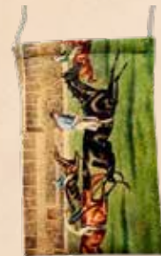
Cross Body Bag