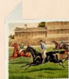
Spectacle Wipe on Card