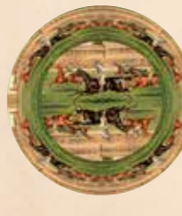
Round Drawstring Bag