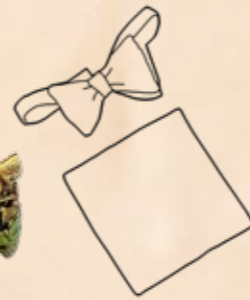
Bow Tie Set