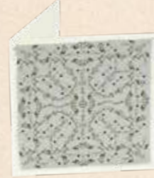
Spectacle Wipe on Card