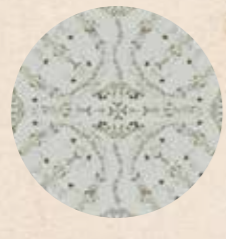
Round Drawstring Bag