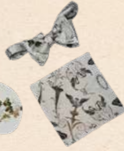
Bow Tie Set