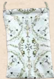
Cross Body Bag